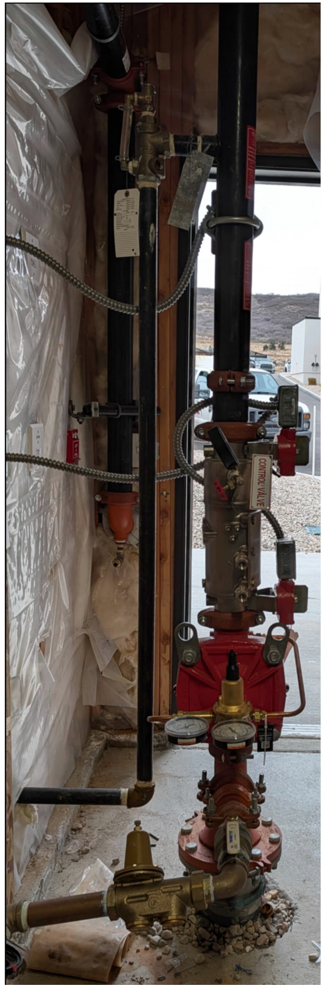
EXISTING 4" RISER