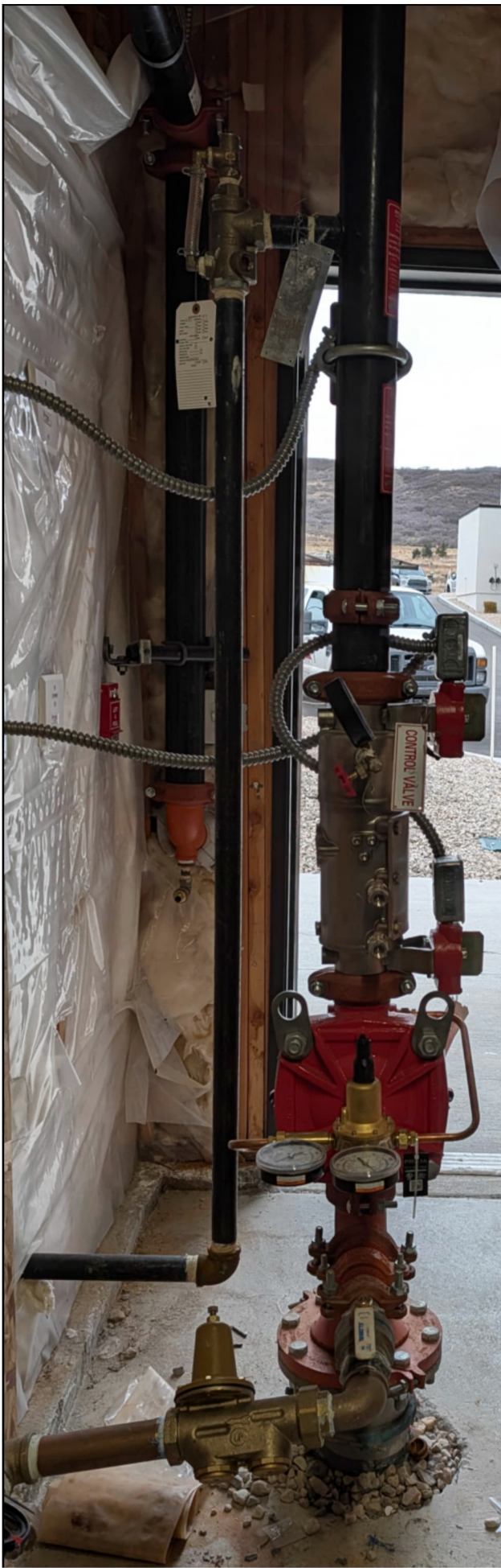
EXISTING 4" RISER